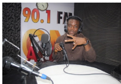
Kelema Wabe 90.1 FM