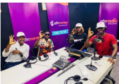
Samza Afriradio 105.3 FM